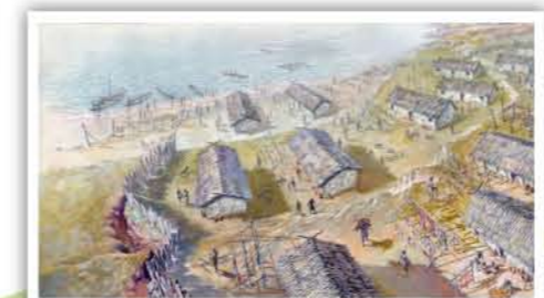
Illustrated by Vladimir Krstić Laci (Source: Vinča by Nerad Tasić, Kreativni centar)

Only a little imagination is needed to conjure up the life in this Neolithic "metropolis", on the right bank of the Danube, more than 7,000 years old. Archaeological remains that testify to origin, boost and disappearance of the Vinča culture, as part of the early European civilization, are kept in the National Museum.