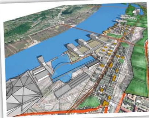
One of the Future Ideas for the Area